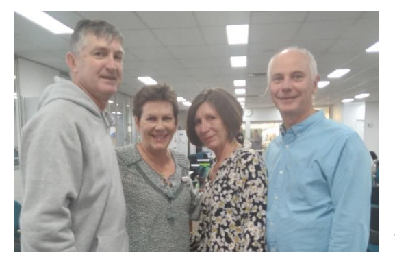
C Grade 2nd Teams Events

You may have noticed that 3 of the 4 competitions mentioned above were teams events. So, what is the difference between teams bridge and pairs bridge? Here is a great article I found on the South Australia Bridge Association Website that explains it really well.