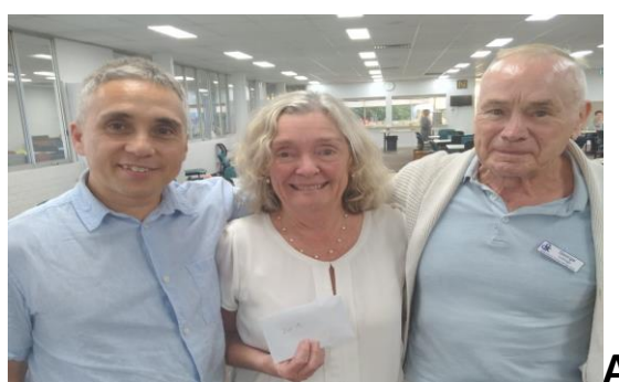
A grade 2nd